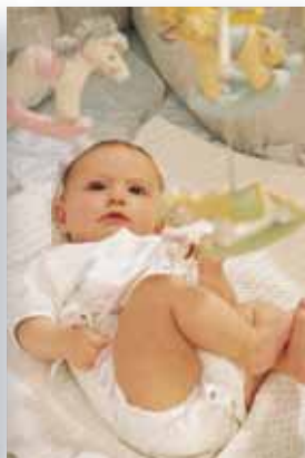
Use it as a baby monitor