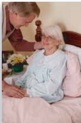
Check on loved ones who are unable to get to a phone