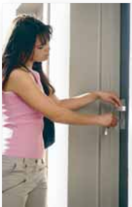
Make sure your child arrives home safely

Guardian VoiceLink™ is peace of mind...when you need it most!